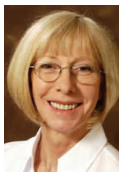
Kate Beecroft Middle