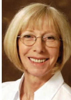
Kate Beecroft Middle