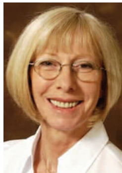
Kate Beecroft Middle