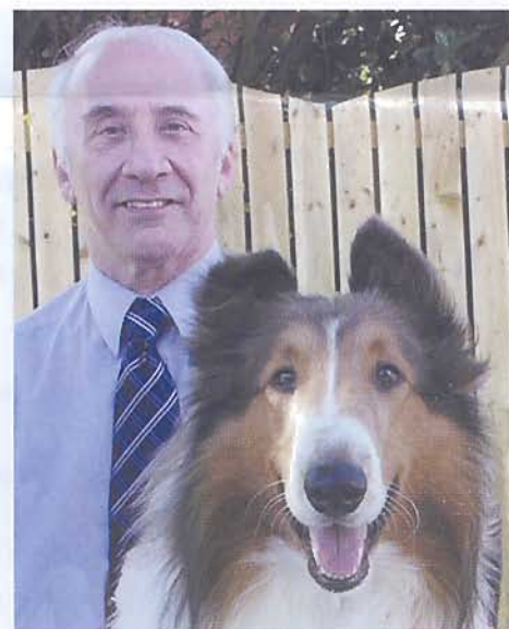
As Chairman of the Film Commission visiting the set of "Lassie"

SOCIAL VOCATION; As Chairman of the Ramsey Cottage Hospital League of Friends, I have led, and continue to lead, the campaign for the restoration of 24 hour service for the North. This is a clear and constant commitment, and is the main reason for asking you to return me to the House of Keys, where I can press home the fight on behalf of everyone in Ramsey and the North.