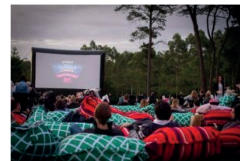
"Poulson Park, outdoor cinema, family nights!"